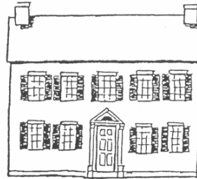
Some were built of brick.....