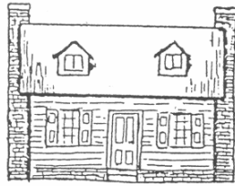
Some were built of wood.....

Circle the house you think the house on page 2 looked like.